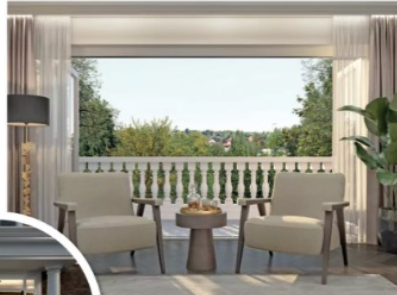
Palatial living space at The Pinnacle