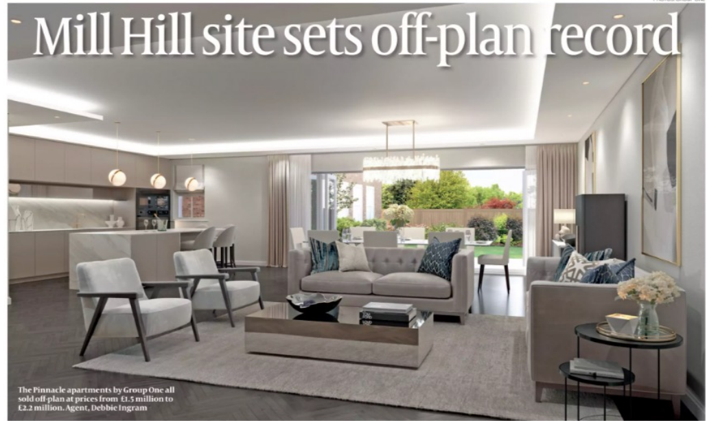
The Pinnacle apartments by Group One all sold off-plan at prices from £1.5 million to £2.2 million. Agent, Debbie Ingram

L uxury boutique developer, Group One, has sold all nine apartments at The Pinnacle, in Mill Hill, north west London, achieving a total gross development value of around £17 million. Ranging from £1.5 million to £2.2 million, the prime apartments were sold completely off-plan, setting a new price record for the area, achieving up to £1,055 per sq. ft.