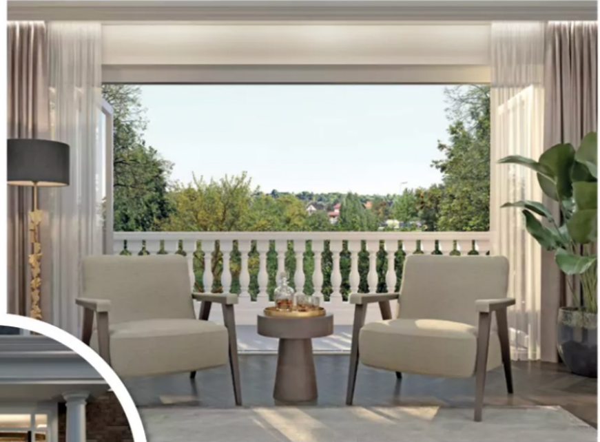
Palatial living space at The Pinnacle